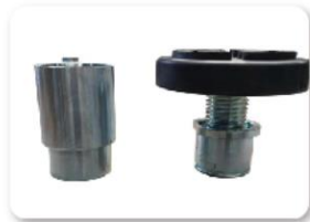
Screw up pads&Adapters