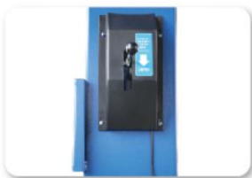
Single unlocking system

Big. Strong. Dependable. The fully gusseted oversized base plates on the TPO12- and the big lifting arms with reinforced swivel pin holes, promise years of reliable service