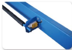
Height limit switch