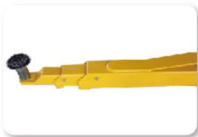
All 3-stages arms