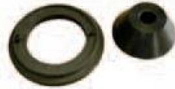
Truck Adaptor Set 35mm