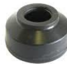
Wheel Centering Plastic Cup