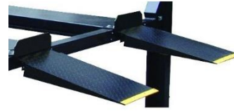
Steel Ramps included