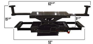
Optional Rolling Jack