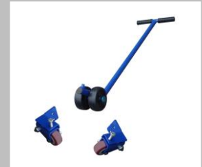
Wheel & Dolly Kit

OPTIONAL EXTENTION KITS FOR ATV & UTV AVAILABLE- SHOWN ON NEXT PAGE