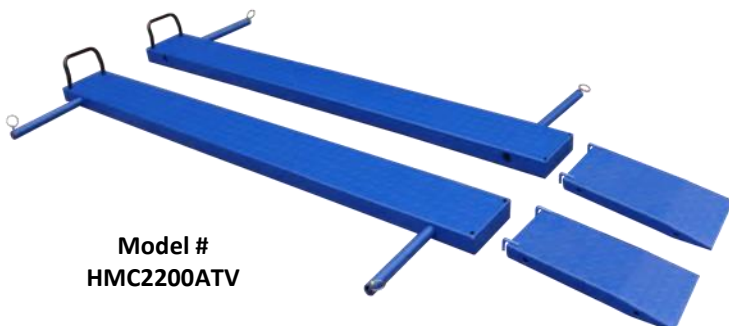
Model # HMC2200ATV

Add the ATV to the HMC2200lift for industry leading platform size and weight capacity with smooth and quiet hydraulic operation. Great for large to small ATVs, golf carts and go karts!