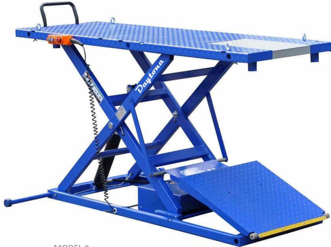
MODEL # HMC2200M

New innovative retractable ramp design pulls ramp into the lift during lifting which saves space and eliminates the need to remove the ramp for service. Wheel chock, dolly kit and vise sold separately